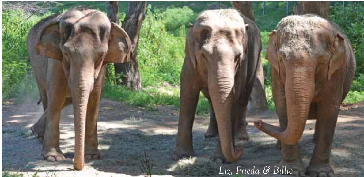
Liz, Frieda & Billie

Accredited by the Global Federation of Animal Sanctuaries Licensed by the United States Department of Agriculture (USDA) and the Tennessee Wildlife Resources Agency (TWRA)