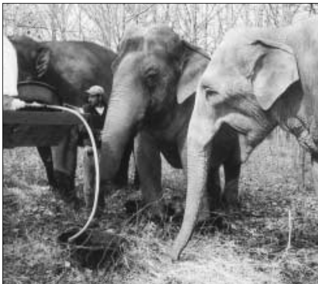
The water truck comes to them...Tarra, Scott, Bunny, and Jenny

The facilities will be designed for herd rotation within the Sanctuary habitat. For example, a herd will live in the Phase II facility for one year. In the Spring they will migrate/rotate to the Phase III facility, living there for the following year. The herd will remain intact, living as a unit, and migrate to a new area within the Sanctuary habitat each year. This migration will afford the elephants a change of scenery every 12 months. In addition, this movement of herds throughout the entire habitat will enable the Sanctuary to provide a home to African elephants.