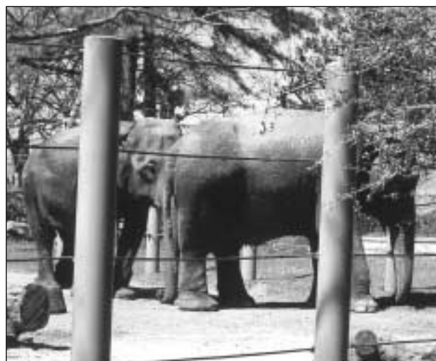
Ellen and Mary

Several months ago The Animal Group of Little Rock, Arkansas, contacted The Elephant Sanctuary. They were interested in retiring Ellen, a 50-year-old elephant who had lived at their zoo her entire life, the past 25 years alone. The group felt Ellen had served their community well and deserved to live out her remaining days in freedom with a herd of her own. They made a presentation to the board of directors of the Little Rock Zoo requesting that Ellen be allowed to retire to The Elephant Sanctuary. The board voted to keep Ellen at the zoo. A few weeks after the citizens' appeal, the zoo acquired another 50-year-old retired circus elephant named Mary. The two are reportedly getting along quite well. The Animal Group is now trying to persuade the zoo to retire both elephants to The Elephant Sanctuary.