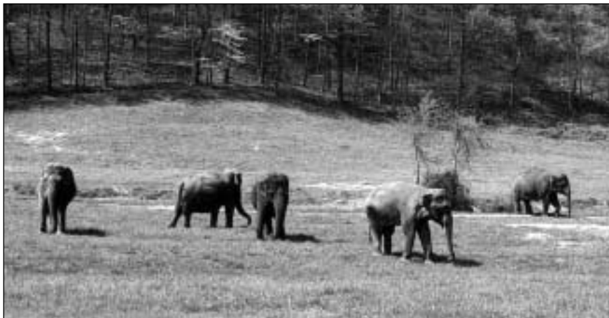
Shirley, Bunny, Winkie, Jenny, and Tarra

A keeper is fired from a well respected zoo in the Pacific North West for allegedly mistreating a young elephant. ....An accredited zoo in the Southwest is found in violation of USDA regulations after an alleged elephant beating that was caught on video tape. ....A Midwest zoo is under USDA investigation for allegedly beating an elephant sent to them on breeding loan.