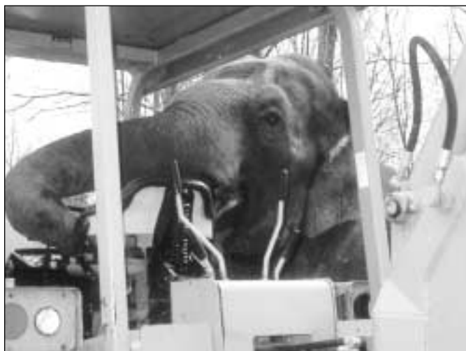
Bunny checks out the tractor