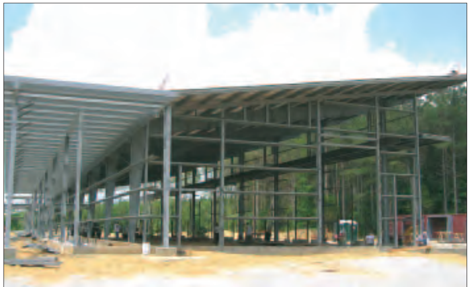
New nine-stall Asian barn

Responding to the need for a home for 16 circus elephants, the Sanctuary raised funds to build a new Asian barn. Employing the same design that was used for the recently constructed African barn, the new Asian barn is designed to be both environmental and elephant friendly. Harnessed solar power and recycled rain water will help to conserve resources and ensure a minimal impact on the environment. With the completion of this nine-stall, state-of-the-art facility, our observation camera system will be increased to include 10 additional cameras, providing 24 hour-a-day non-intrusive observation.