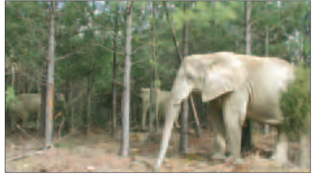
Flora, Tange and Zula

In 2004 the Sanctuary welcomed five new elephants, including our first three African elephants, Tange, Zula and Flora. Tange and Zula came from the Chehaw Wild Animal Park in Albany, Georgia. Thanks to the progressive attitude of the zoo's director, Tange and Zula became the first African elephants from an AZA institution to be moved to a sanctuary for welfare concerns. Flora, a circus performer for 18 years, had lived at the Miami Metro Zoo for three years prior to moving to the Sanctuary. Tina spent the year in hospice care after arriving with an advanced case of osteomyelitis in her toes. Her condition was so advanced that no amount of drug therapy would save her. She passed quietly on the night of July 21st, with her keepers and elephant sisters by her side. Misty and Lota, both Asian, had been "owned" by a company that rented them to circuses. Following a lawsuit filed by the USDA, the Hawthorn Corporation agreed to place all 16 of their elephants in new homes. Lota and Misty were special needs elephants since they both had tested positive for tuberculosis. After months of negotiations with the Hawthorn Corporation and the state of Tennessee, a comprehensive tuberculosis protocol was developed. The Sanctuary adopted the protocol and immediately received permission to import Misty and Lota so that they could receive the veterinary care they needed.