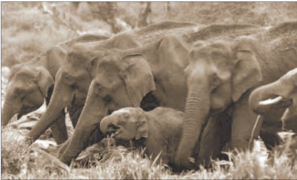
A family of wild elephants that benefit from Sanctuary support

The Elephant Sanctuary supports several efforts benefiting captive and wild elephants in Asia.