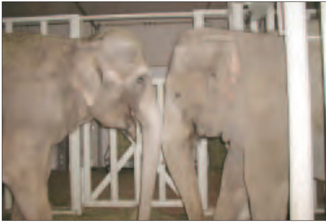
Lota and Misty in the newly renovated quarantine barn