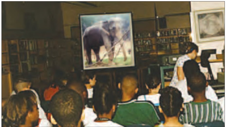
Video teleconference visit with inner city students

Providing a separate space for the African species has increased the Sanctuary's impact on the welfare of captive elephants. The 2,700 acre preserve has been divided with separate habitats and facilities for each species. This is appropriate since African and Asian elephants would never meet in the wild; they are completely different species with different languages, behaviors and dietary needs.