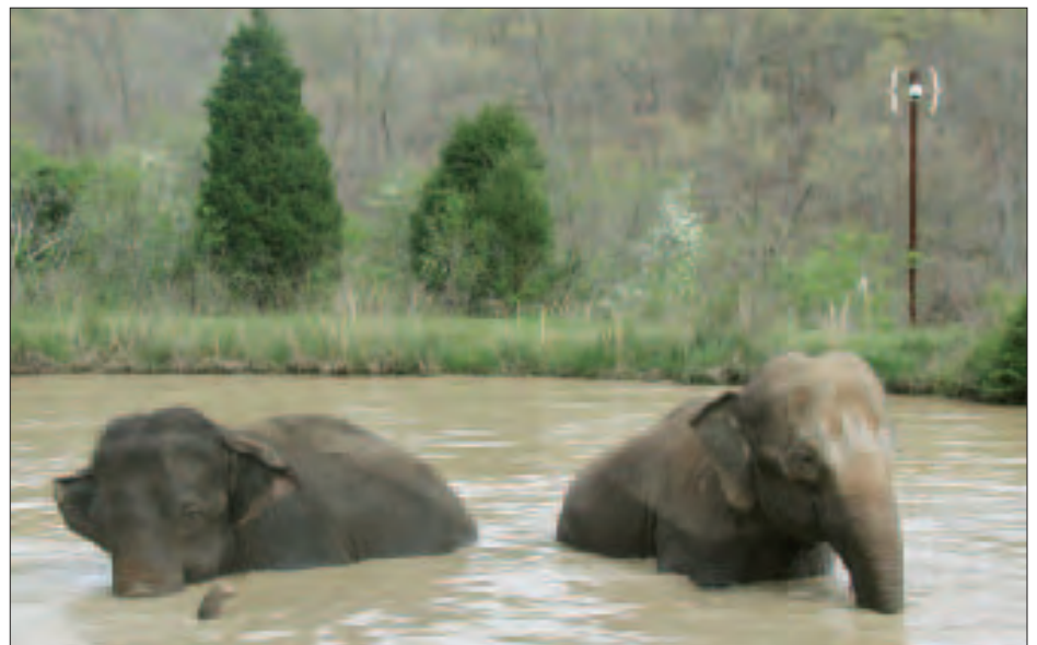
Ten additional observation cameras like this one by the pond are planned for 2005