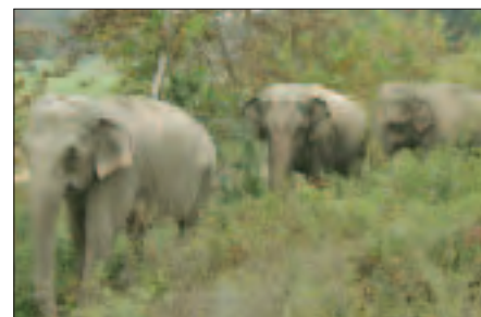
The growing herd at The Elephant Sanctuary.